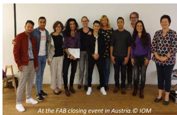
At the FAB closing event in Austria.

The closing conference in Brussels on 10 September 2019 was attended by 44 European stakeholders. The final report's recommendations were also presented: engage existing foster carers in training activities; foster carers' recruitment activities as stand-alone projects; develop e-learning course or thematic half-day trainings to enhance sustainable knowledge acquisition; promote buddies or mentoring programs offering connection with families and enhance mental health support and access to it.