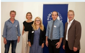
EMN at the Dialogforum.