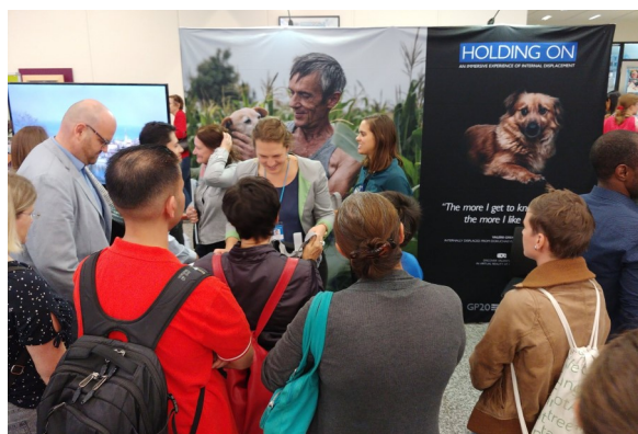
IOM Austria at the VIC Open House Day.

As part of the VIC40 roadshow, IOM Austria was invited to give a presentation in a high school in Vienna (GRG 11, Gottschalkgasse, 1110 Vienna) on 26 September 2019. With the help of a quiz on IOM's history, its definition of migrants and some data as well as with a video produced in the framework of the project WIR.I , students of GRG 11 were informed about IOM's work and the topic of migration.