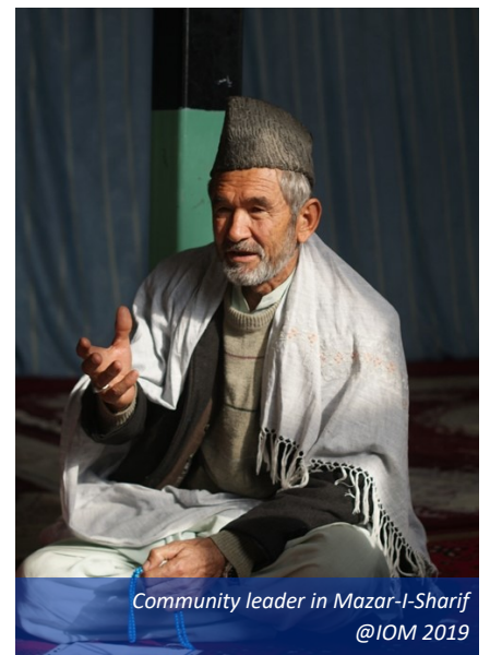
Community leader in Mazar-I-Sharif