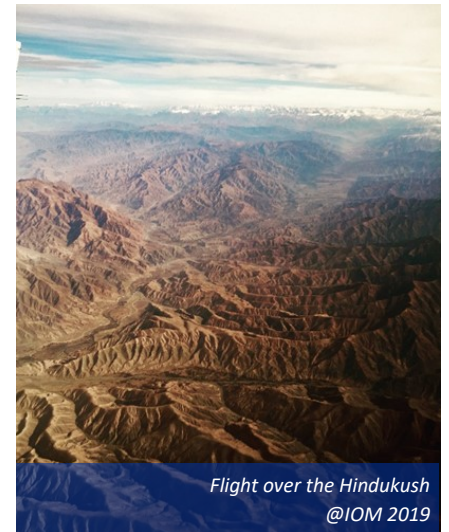
Flight over the Hindukush

For more information, please contact the AVRR Unit at IOM Austria: avrr.vienna@iom.int