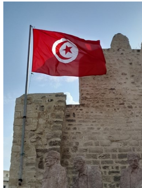
Tunisian flag in Sousse

On a general note, IOM Austria was impressed by the stories of the returnees, who faced various challenges after their return. Due to high inflation and unemployment rates, returnees highly depend on the financial support of their families and friends. The income generated through the investment of the reintegration assistance in businesses such as a grocery store, a mobile phone shop, a tailor's shop, a business for renting decorations and objects for weddings, or a farm serves as an additional income for the family in many cases.