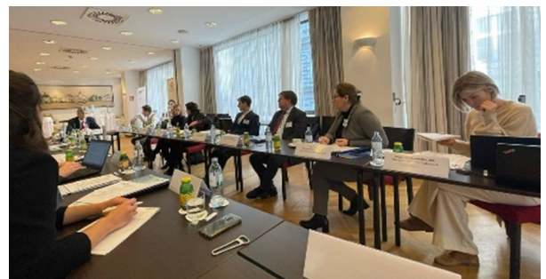
EMN Steering Committee Meeting

On 25 November 2022, the Members of the Steering Committee of the National Contact Point Austria met for their 15 th annual meeting in Vienna. The National Steering Committee was established in 2008 to embed the National Contact Point Austria in the research and policy community working on migration and asylum.