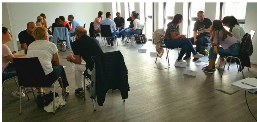
Training participants discuss communication challenges in their work with migrants and asylum seekers.