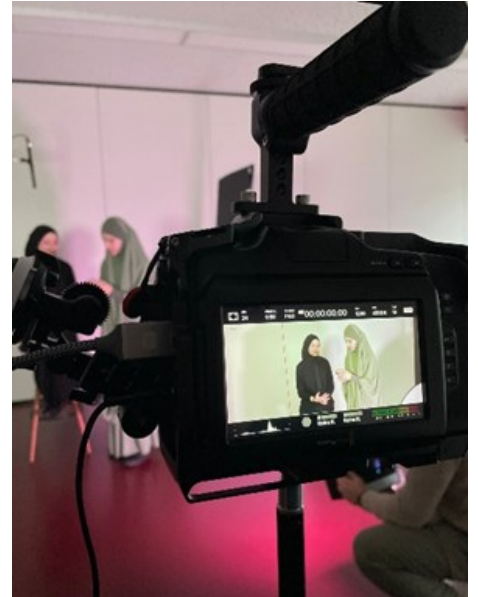
Young workshop participants prepare for their interview.

The video blogs will be presented at our closing event in Graz on 21 January 2023!